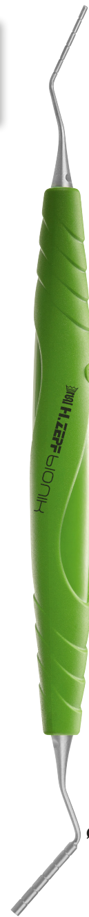
24.532.19 Condenser, titanium

with graduation 3/6/9/12/15 mm for depth measurement and for condensing augmentation material around an implant. BIONIK Handle, yellow-green.