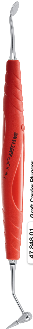
47.848.01 Graft Carrier Plugger

Plugger/Spoon combination for contouring and inserting grafts. BIONIK Handle, lightred-magenta.