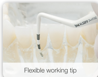
Flexible working tip