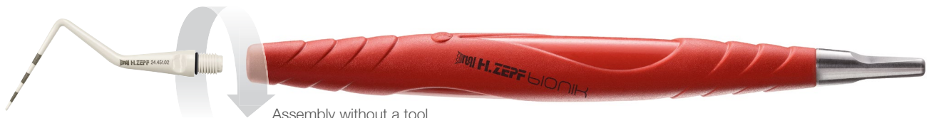
Assembly without a tool