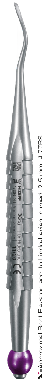
X-Approximal Root Elevator, acc. to Lindo-Levien, curved, 2.5 mm, # 77RS, mesial elevator, purple metallic