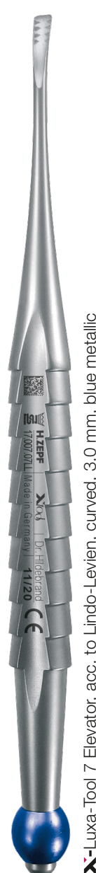
X-Luxa-Tool 7 Elevator, acc. to Lindo-Levien, curved, 3.0 mm, blue metallic