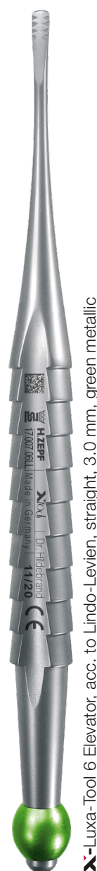
X-Luxa-Tool 6 Elevator, acc. to Lindo-Levien, straight, 3.0 mm, green metallic