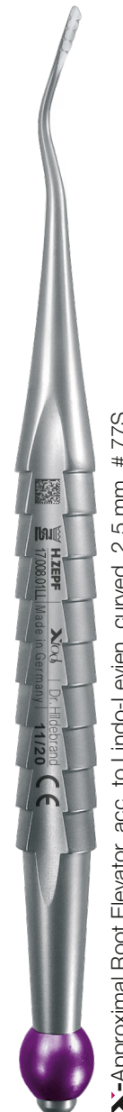
X-Approximal Root Elevator, acc. to Lindo-Levien, curved, 2.5 mm, # 77S, distal elevator, purple metallic